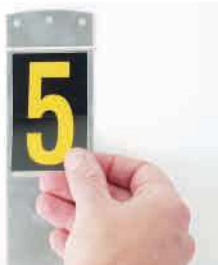
Easy to align and attach.

*See how to order on back side of this sheet