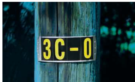
Durable aluminum won't split or crack.